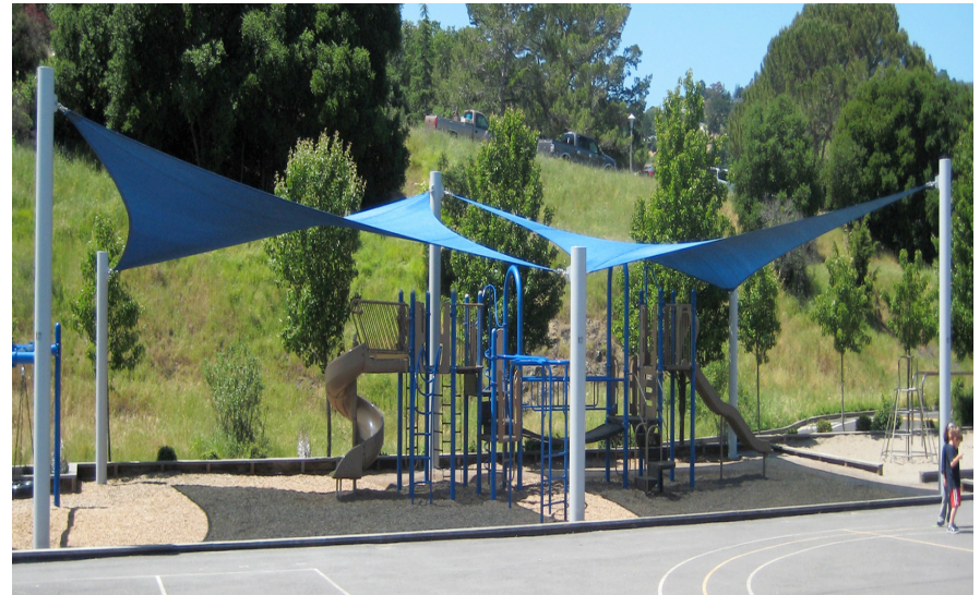
Asphalt Play Area