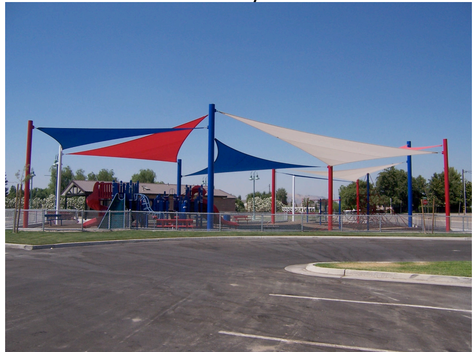
Main Play Area